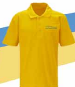
Gold short sleeved polo shirt