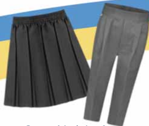
Grey skirt/pinafore Grey trousers (short or long)