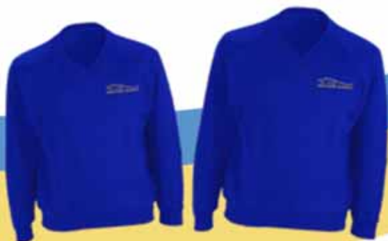
Royal Blue Jumper/Cardigan