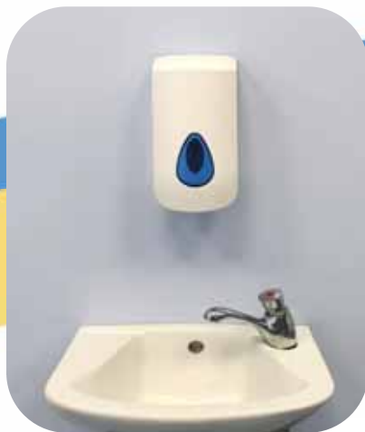
Push for Soap & Water