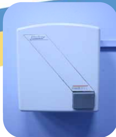
Press to Dry