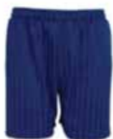
Royal Blue PE shorts