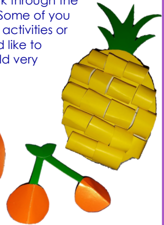
Myra - Ruby