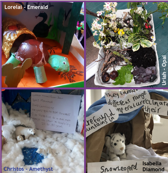
Lorelai - Emerald