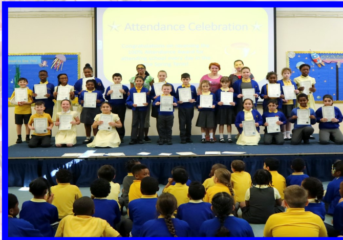
Some top attenders receiving their awards.

What an excellent outcome we had for our Spring term attendance award! This term we decided to run a special Attendance Ceremony to which all pupils and parents/carers with 100% attendance were invited! Congratulations, it was wonderful to see all of those successful faces collected together. Now let's see who will be receiving their award for the Summer term celebrations. Keep up the hard work everyone!