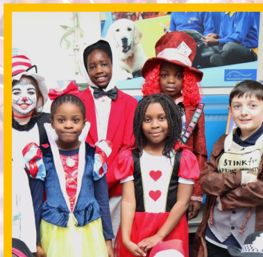
World Book Day Best Dressed!

Well done to all pupils and staff who made an exceptional effort on world book day. A special congratulations to the pupils who were selected as best dressed! If you didn't win this time you have plenty of time to get reading and plan your outfit for next years celebration of reading.