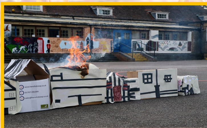
Year 1 make their very own Pudding Lane.

Year 1 had a very busy lesson during Spring 2 Term learning all about the Great Fire of London. Their art related project involved creating their very own Pudding Lane buildings. As part of their Fantastic Finale the children were able to watch the model buildings being burned as a demonstration of how fast fire can spread, as well as learning all about the Great Fire of London and how it happened. This was a perfect opportunity to talk about fire safety. Well done Year 1, we got plenty of photographs of the occasion so if you want to look back to how your model looked before the fire you can visit the school website under the News Archive section!